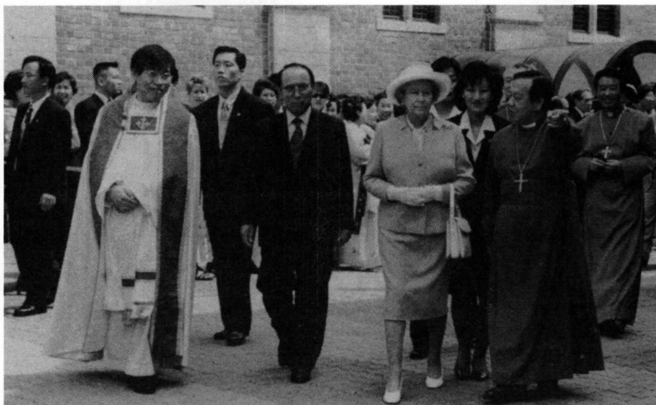
〈국빈 방한하였던 엘리자베스 영국 여왕이 4월 22일 오전 서울주교좌성당을 방문하였다〉