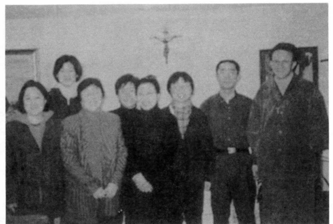
재속회 모임 - 구미 회원들과. Members of the Kumi Third Order discussion group

The Secular Franciscan Order (also called Third Order) is a group of people who feel that they are called in some way to learn from St. Francis and his following of the gospel of Jesus Christ. So far we have two groups of people who want to learn more about St Francis and about a Franciscan understanding of their lives and ministries. We are meeting monthly in Seoul and Kumi and beginning to reflect on the life of Francis and its meaning for us today. One of their questions seems to be how to connect their daily lives; their ministries and their spirituality. We hope the Secular Franciscan Order can help with their search.