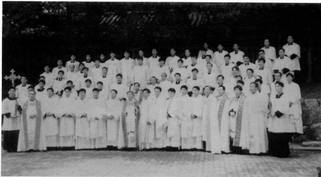
〈서울교구는 5월27일 성직서품으로 총 84명의 성직자를 갖게 되었다〉