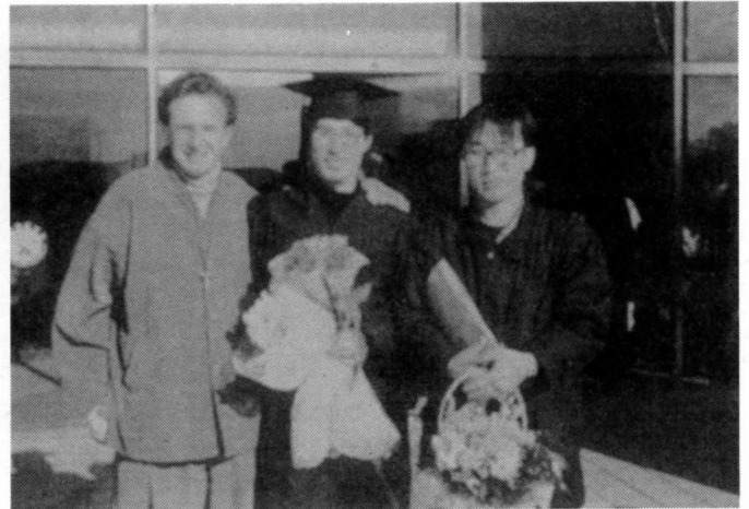
성공회대학교 졸업식. Graduation day at Sungkonghoe University