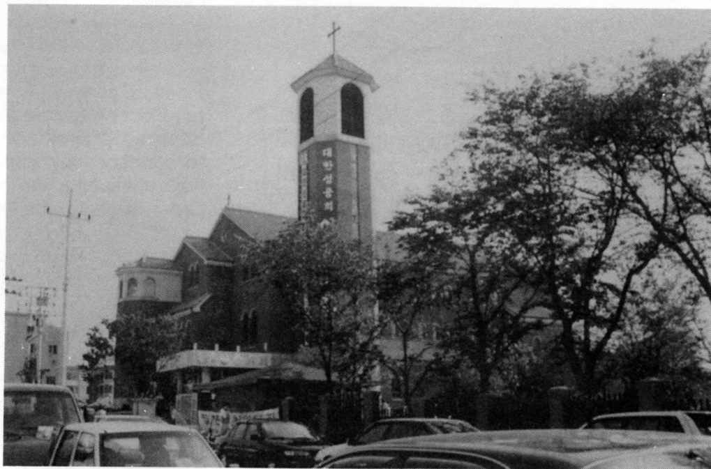
〈안중교회 교우들은 이번에 축성된 새 성전 건축을 위해 4억원의 특별헌금을 봉헌하였다〉