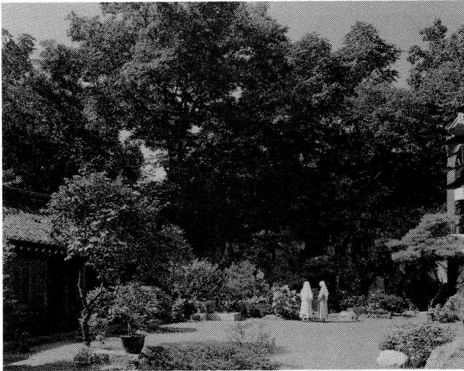
The Convent Garden